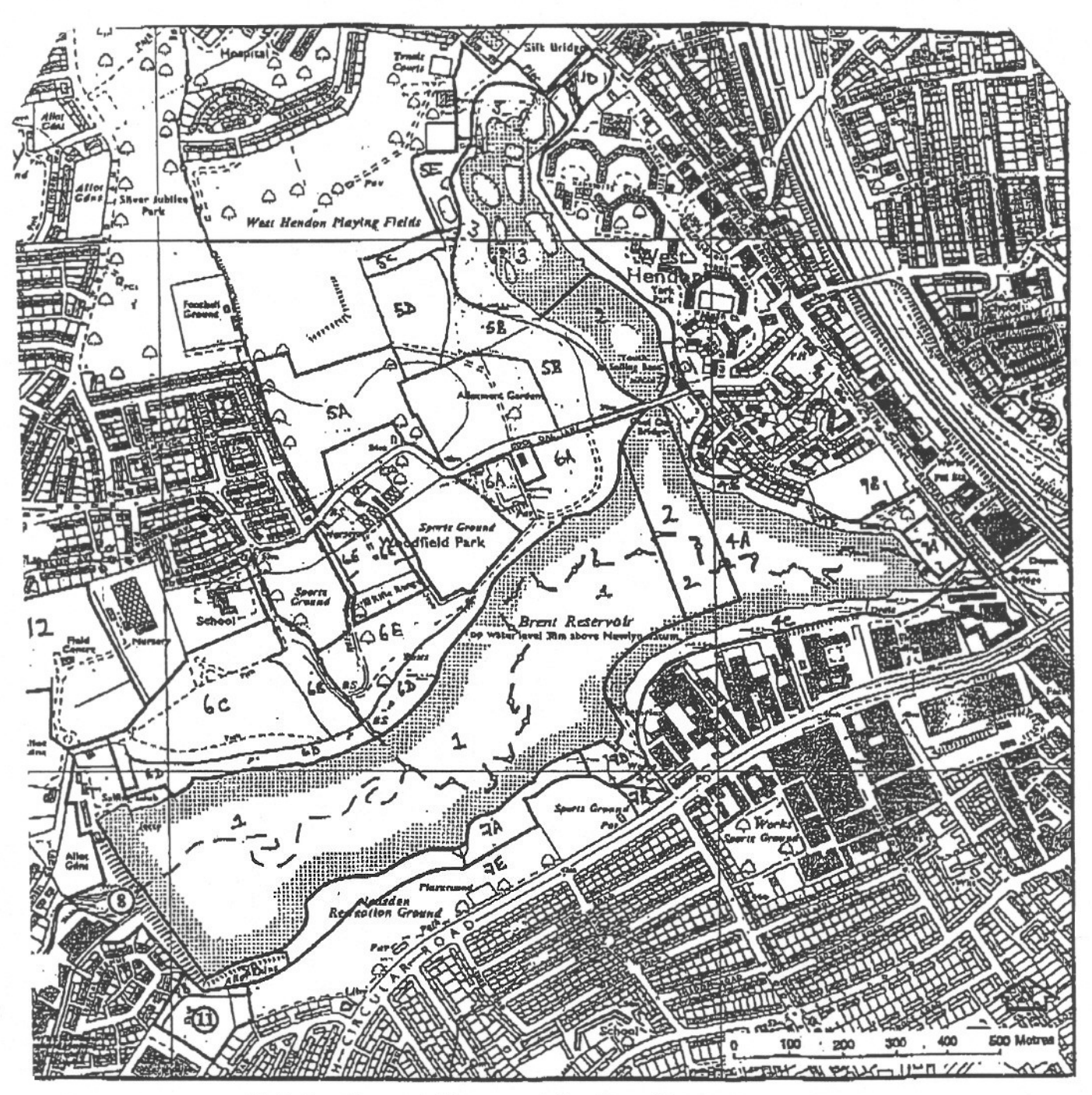
Welsh Harp Reservoir: Management Plan Zones Map